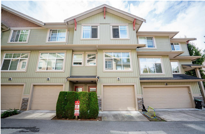
30 - 20967 76 AVENUE LANGLEY, BC

Ideal for young families! This spacious 3-bedroom home is tucked inside the complex, featuring a sunny south-facing yard that opens onto your own private playground. Recently updated with fresh paint and brand-new carpet, it feels bright and move-in ready. Just steps from Richard Bulpitt Elementary and Willoughby Town Centre-parks, shops, and amenities are all walkable. Located in a family-friendly, well-run strata, you'll enjoy a true sense of community. The main level offers an open, flexible layout with a powder room, while upstairs has 2 full baths. Pet- and rental-friendly too-perfect for your lifestyle! (id:6289)