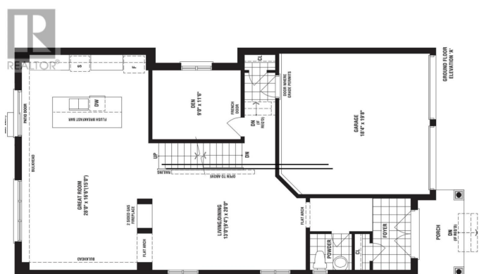
Illustration purposes only, Errors & Omissions Excluded