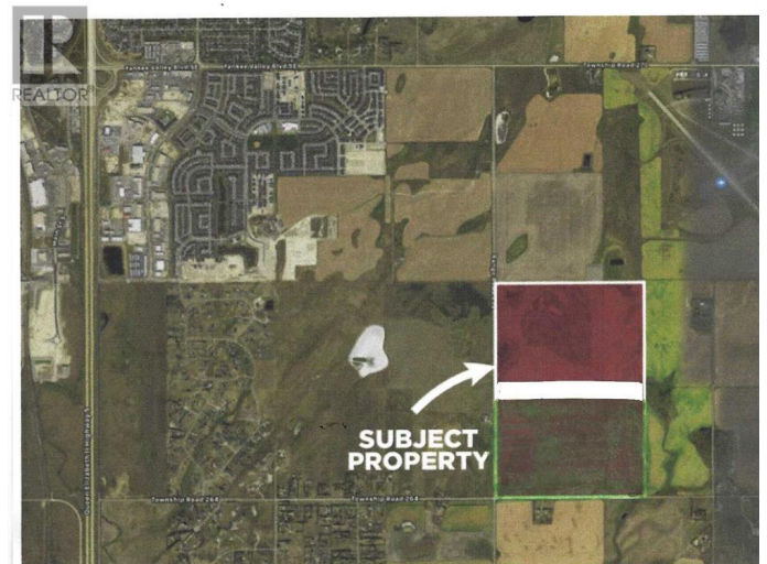
Balzac East Area Structure Plan Schedule 'A' of Bylaw C-5177-2000 Figure 2: Conceptual Vision