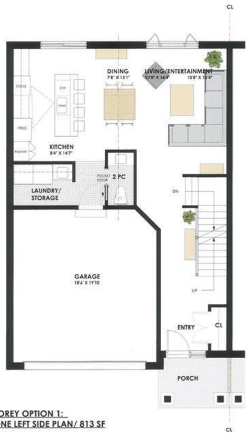
TWO STOREY OPTION 1: LEVEL ONE LEFT SIDE PLAN/ 813 SF